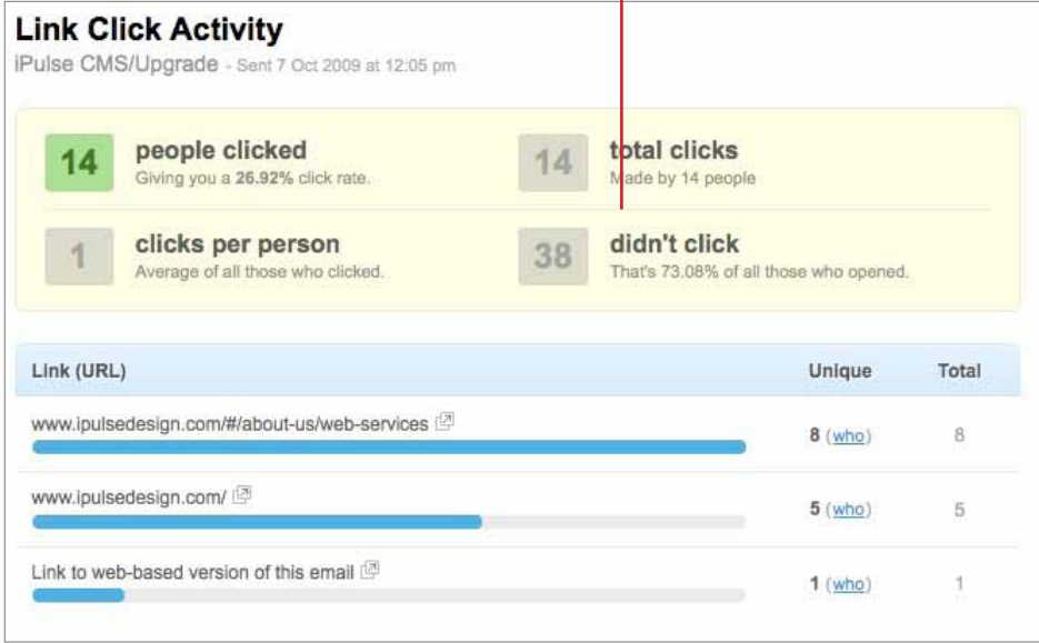
Detailed analytics statistics.

The link click summary showing which links to your website are the most popular from the EDM